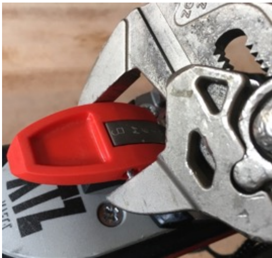
Press the nail

Press the ail into the rivet with a pair of pliers