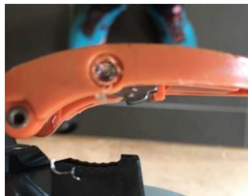
The riveting remove by drilling